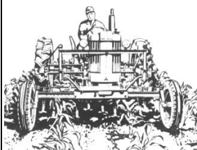
John Deere 40